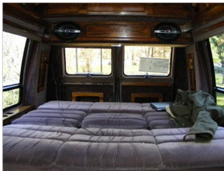
Don't run out of batteries...