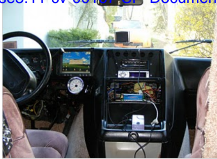
Throw in a nice TV and some fuzzy carpet...