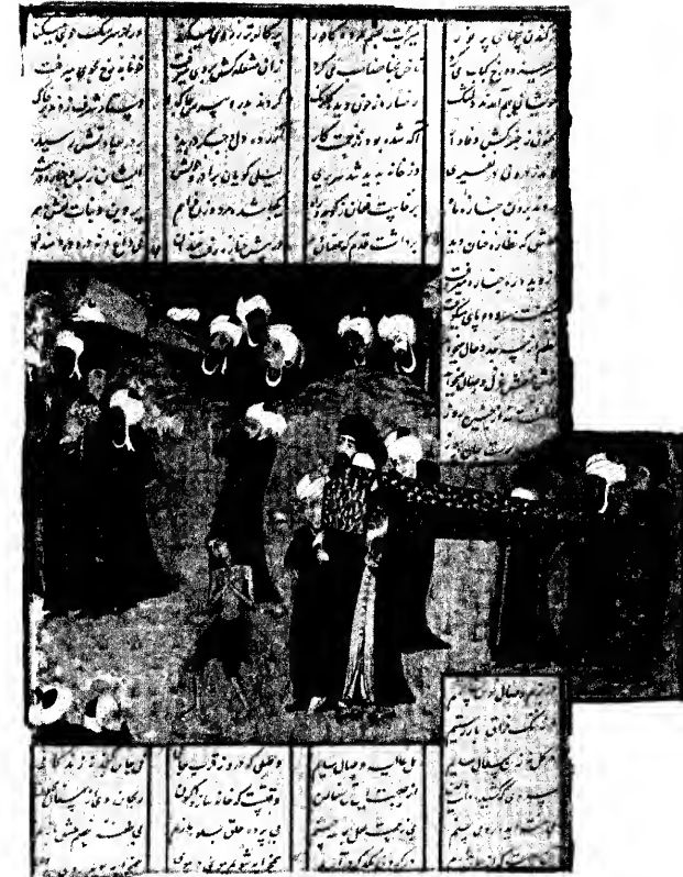
Layla is carried to her grave. Majnun walks in front of the coffin

Thus the caravan moved through the desert. The sand wept with Majnun, the mountains echoed his mourning songs, his lament struck sparks from the thorn-bushes in the gorges and the stones of the steppe glowed with the colour of his blood.