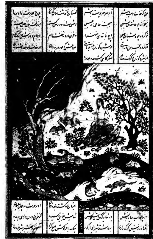
Majnun and the wild beasts

But the more he became the master and friend of the animals, the less often did he encounter human beings. Many of those who had visited him feared his new followers. When he appeared with his companions, people avoided him. If somebody insisted on seeing him, the animals, full of suspicion, gathered around their king, bared their teeth and growled, until Majnun calmed them down and ordered that the visitor be admitted.