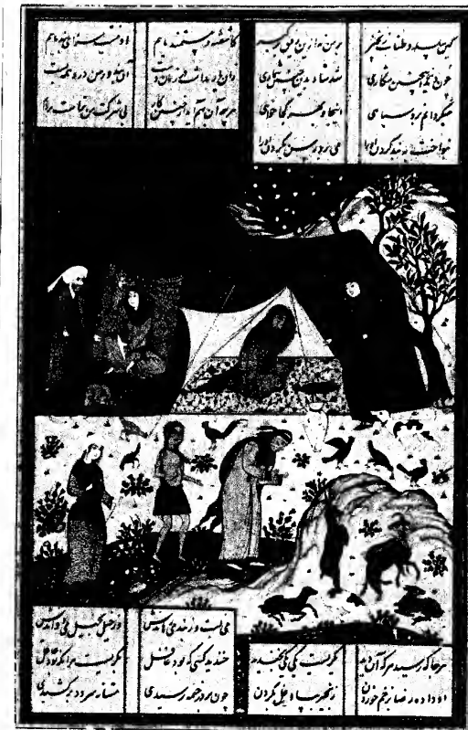
Majnun in Chains led to Layla's tent by the Beggarwoman

Whenever the woman and her prisoner came to a tent, they stopped: Majnun recited his love poems,