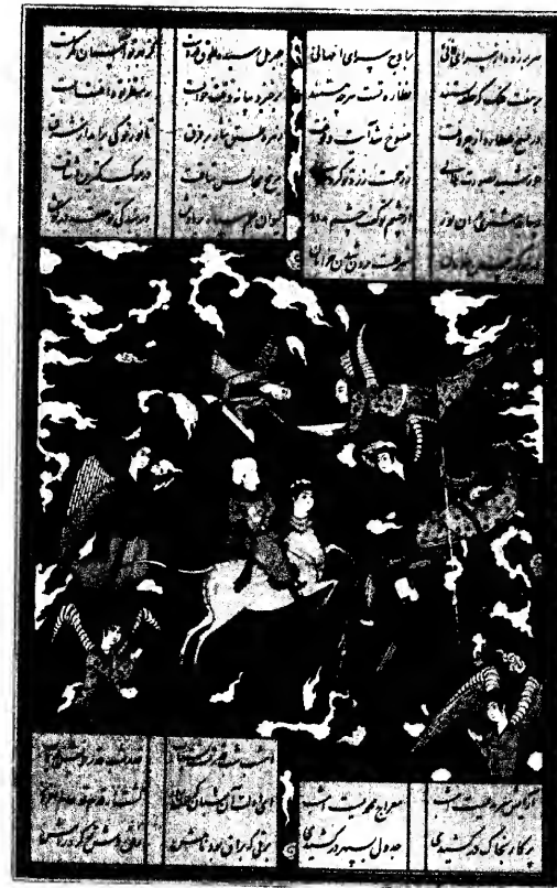
Riding from Jerusalem through the seven spheres of the planets on his horse Boraq, the Prophet Mohammed ascends to Heaven (Illustration to one of the prefaces to the Book of Layla and Majnun)

Thus the dead man was left alone; even beasts which feed on carrion did not touch him. What little remained of him fell into dust and returned