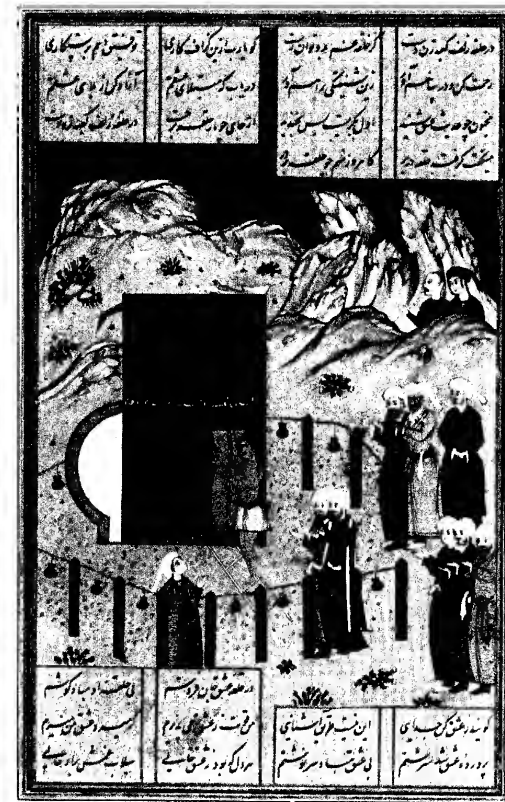
Majnun before the Holy Caaba in Mecca

When Majnun heard his father speaking he wept, then began to laugh. Suddenly, a strange thing happened. He darted forward like the head of a coiled snake, stretched out his hands towards the