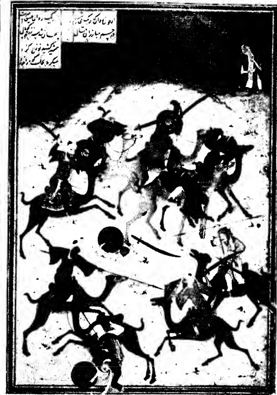
The battle between Nawfal's men and Layla's tribe

Were they really his friends? Were they not