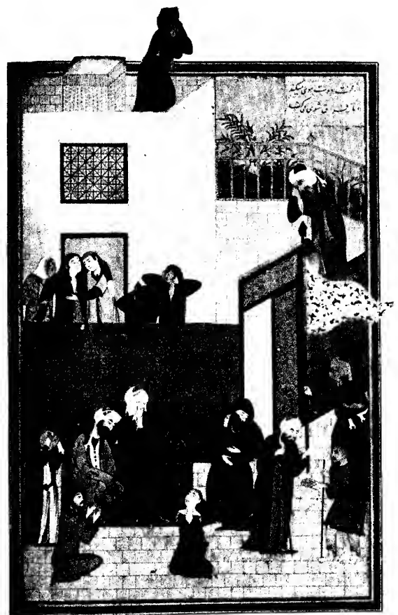
Mourning for Layla's husband

Nothing could be more welcome to Layla. Now she was free, without fear, to give heart and soul to her beloved.