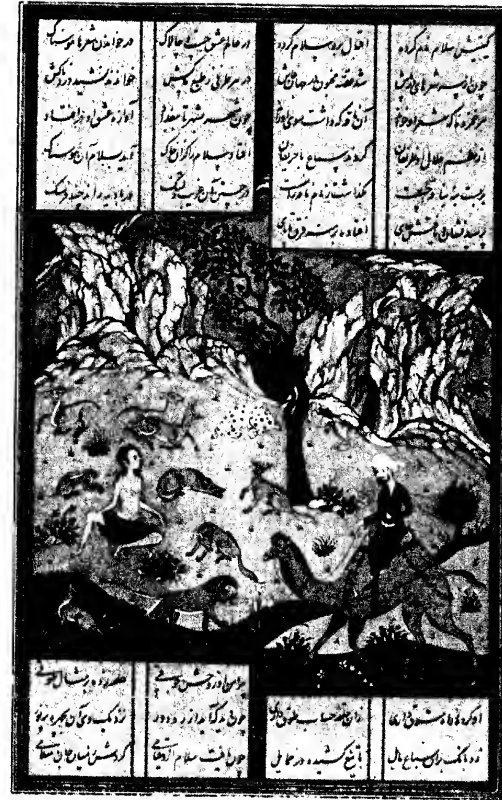
The Youth from Baghdad visits Majnun among his animals

'I have reached journey's end', was the reply;