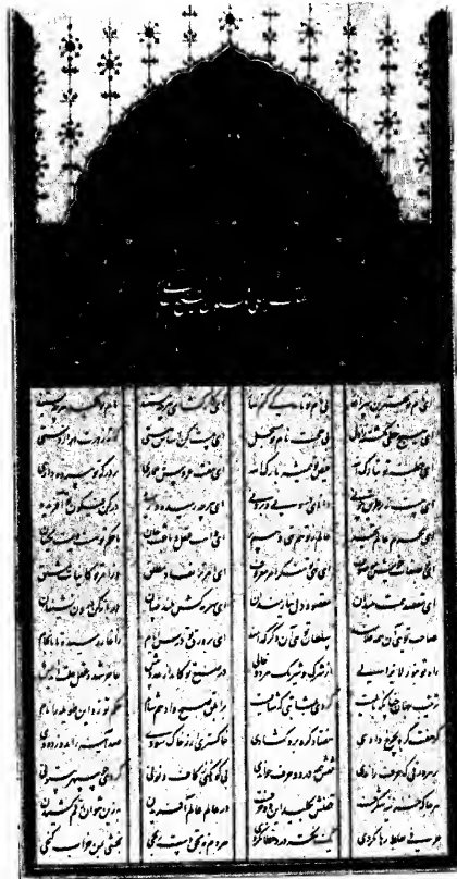
First page of a manuscript in the Bibliothèque Nationale with the caption THE BOOK OF LAYLA AND MAJNUN BY SHEIK NIZAMI