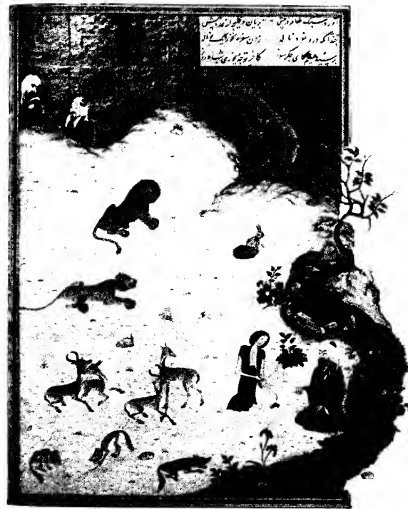
Salim visits Majnun in the desert

Only then did Majnun recognize his visitor. He ordered his animals not to attack, received him with all honours and asked him to be seated. Then he enquired about kinsfolk and friends and his visitor's well-being. How surprised and happy was Salim to find his nephew so reasonable! Was this a madman, deserving of the name given to him? Of course, if one only judged by appearance the mistake was understandable. But as he examined his sister's son closely from head to foot, Salim felt shame and grief rise in his heart. How could this have happened? Majnun walked like a corpse newly risen from the grave! Risen—where and for whom, for the beasts of the wilderness? A corpse would at least wear a shroud, while this man was stark naked.